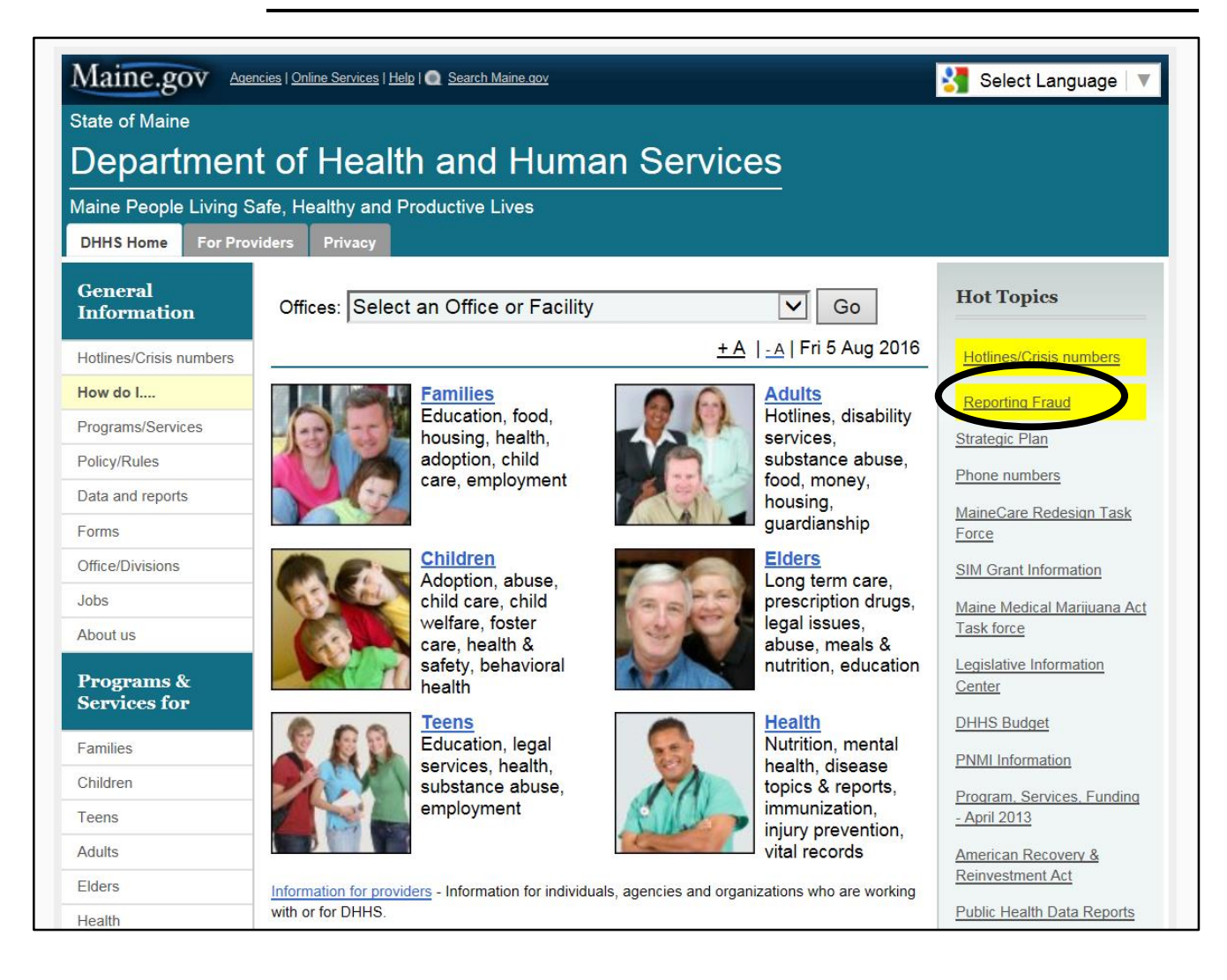
Figure 3: Screen Print of Maine's Department of Health and Human Services Web Pages, as of August 5, 2016

Maine (Figure 3) and Illinois (Figure 4) prominently display how to report fraud on their websites. In addition, these states allow the person making the allegation to report the information in multiple ways, including via the websites themselves.